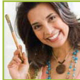
Connect with IN Art Educators!