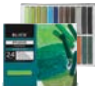
Blick Studio Pastels, Landscape Set of 24 Item #20016-0249