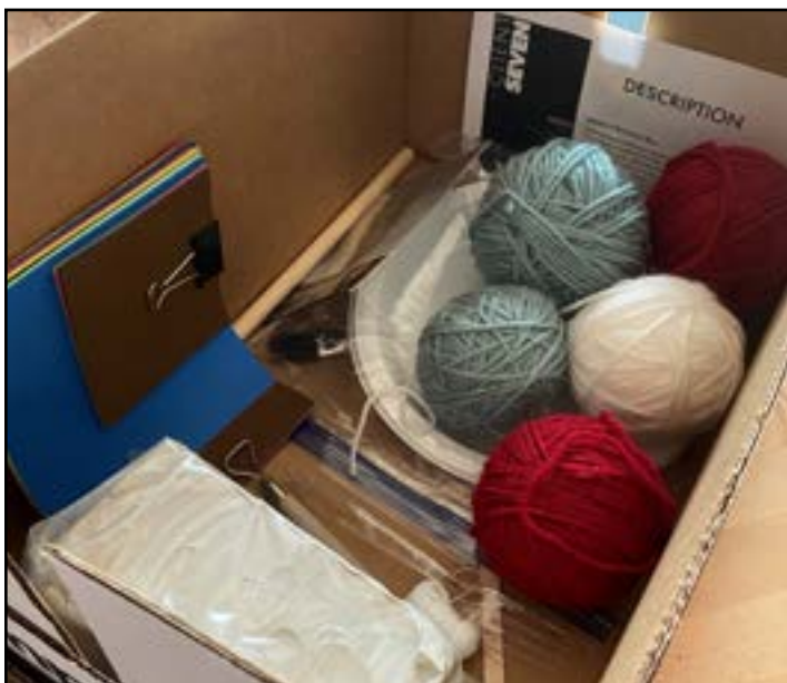
Go-Kits prepared for Intro to 3D students keep everything in place for each student.

1. Connect with other art teachers. They are a well of information and resources. When I am stuck on a problem and can't see my way out, I text my teacher friends, or I turn to the Art Teachers Facebook group and seek out solutions. My friends have helped me devise a good altered curriculum for the year where the projects are very transportable for when a student is sent into quarantine.