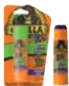
Gorilla Kids Glue Sticks Item #23976