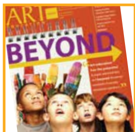
Receive $50+ in Subscriptions!

Connect with visual arts education professionals from across the country and receive exclusive benefits that can stimulate your career, your classroom, and your creativity.