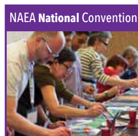
National Convention Discounts!